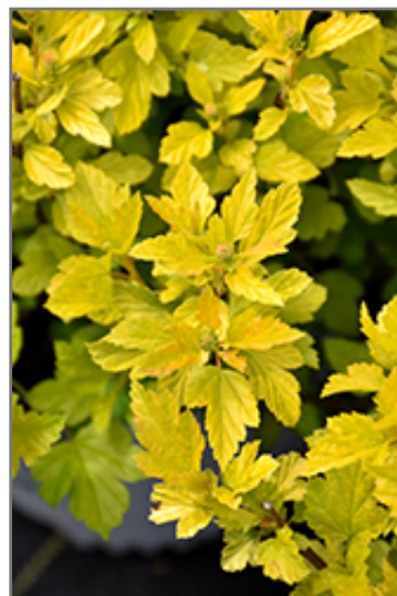
Tiny Wine Gold Ninebark foliage

Tiny Wine Gold Ninebark is recommended for the following landscape applications;