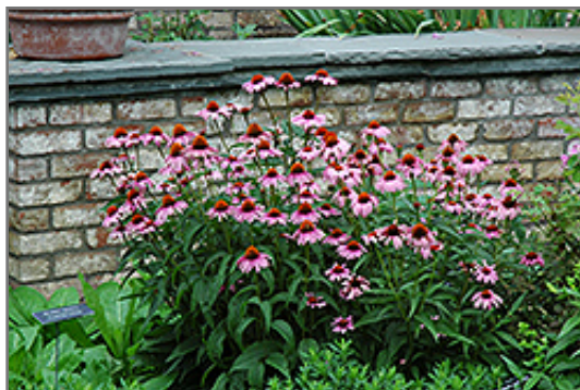
Magnus Coneflower in bloom