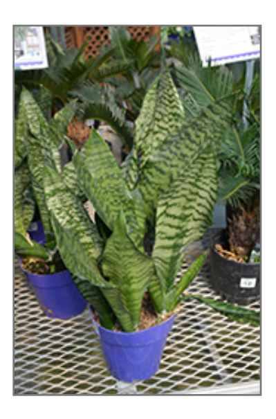
Futura Robusta Snake Plant

When grown indoors, Futura Robusta Snake Plant can be expected to grow to be about 24 inches tall at maturity, with a spread of 12 inches. It grows at a slow rate, and under ideal conditions can be expected to live for approximately 10 years. This houseplant performs well in both bright or indirect sunlight and strong artificial light, and can therefore be situated in almost any well-lit room or location. It is very adaptable to both dry and moist soil, and should do just fine under average home conditions. The surface of the soil shouldn't be allowed to dry out completely, and so you should expect to water this plant once and possibly even twice each week. Be aware that your particular watering schedule may vary depending on its location in the room, the pot size, plant size and other conditions; if in doubt, ask one of our experts in the store for advice. It is not particular as to soil pH, but grows best in sandy soil. Contact the store for specific recommendations on pre-mixed potting soil for this plant.