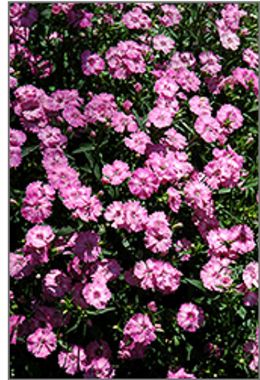
Blue Hills Pinks flowers

Blue Hills Pinks is recommended for the following landscape applications;