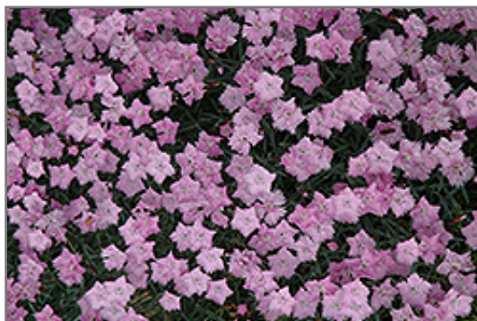
Bath's Pink Pinks in bloom

Bath's Pink Pinks is recommended for the following landscape applications;