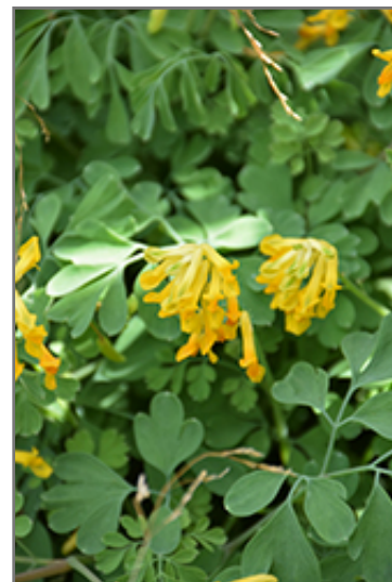
Golden Corydalis flowers