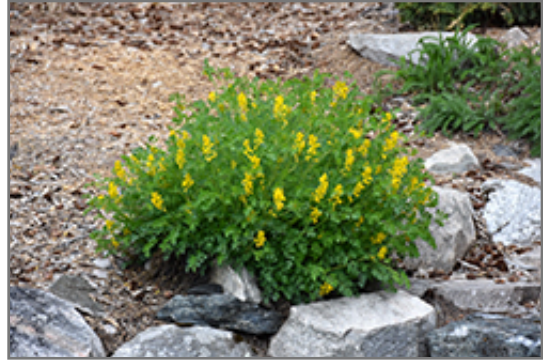
Golden Corydalis in bloom

Golden Corydalis will grow to be about 12 inches tall at maturity, with a spread of 12 inches. Its foliage tends to remain dense right to the ground, not requiring facer plants in front. It grows at a medium rate, and under ideal conditions can be expected to live for approximately 5 years. As an herbaceous perennial, this plant will usually die back to the crown each winter, and will regrow from the base each spring. Be careful not to disturb the crown in late winter when it may not be readily seen!