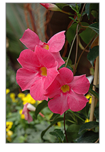
Sun Parasol Pretty Pink Mandevilla flowers

Sun Parasol Pretty Pink Mandevilla features bold pink tubular flowers with yellow throats along the branches from late spring to mid fall. Its glossy pointy leaves remain dark green in colour throughout the year.