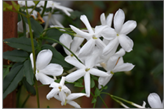
Climbing Jasmine flowers

This is a dense multi-stemmed evergreen houseplant with a spreading, ground-hugging habit of growth. This plant may benefit from an occasional pruning to look its best.