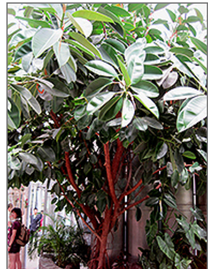
Rubber Tree