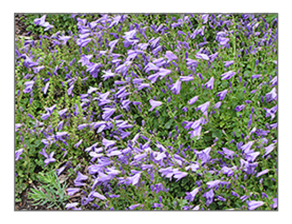
Birch Hybrid Bellflower in bloom