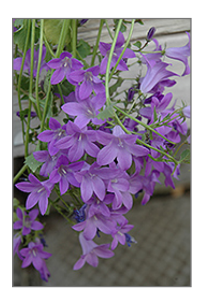
Birch Hybrid Bellflower flowers