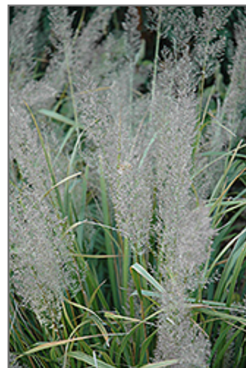
Korean Reed Grass fruit