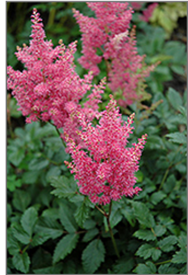
Rheinland Astilbe flowers

Rheinland Astilbe is recommended for the following landscape applications;