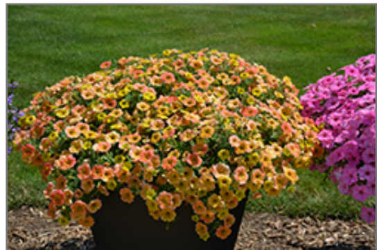
Supertunia Honey Petunia in bloom