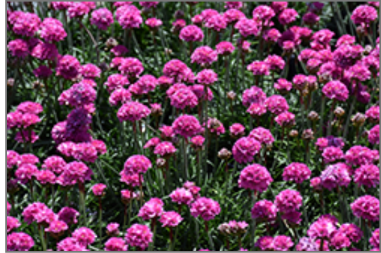
Dusseldorf Pride Sea Thrift flowers

Dusseldorf Pride Sea Thrift will grow to be only 6 inches tall at maturity extending to 8 inches tall with the flowers, with a spread of 8 inches. Its foliage tends to remain low and dense right to the ground. It grows at a slow rate, and under ideal conditions can be expected to live for approximately 10 years. As an evergreen perennial, this plant will typically keep its form and foliage year-round.