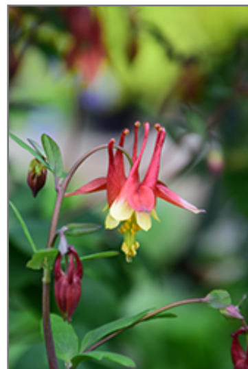
Wild Red Columbine flowers