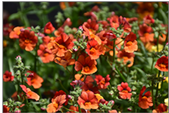
Sunsatia Blood Orange Nemesia flowers