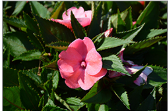
SunPatiens Spreading Shell Pink New Guinea Impatiens flowers

SunPatiens Spreading Shell Pink New Guinea Impatiens is recommended for the following landscape applications;