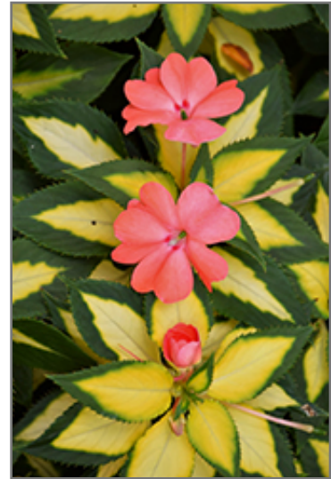
SunPatiens Spreading Salmon New Guinea Impatiens flowers

This plant will require occasional maintenance and upkeep, and should not require much pruning, except when necessary, such as to remove dieback. It is a good choice for attracting bees and butterflies to your yard. It has no significant negative characteristics.