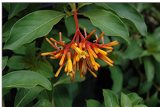
Dwarf Firebush flowers