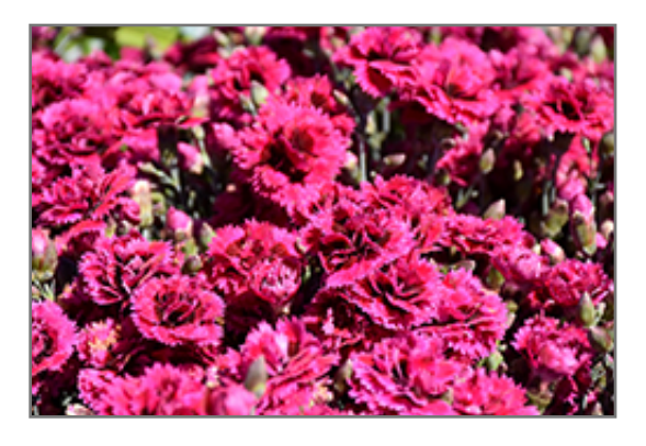
Starlette Pinks flowers

Starlette Pinks is recommended for the following landscape applications;