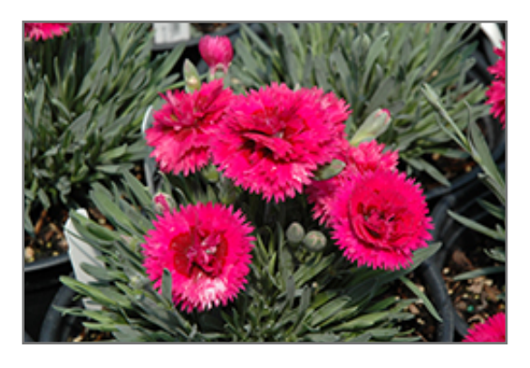
Starlette Pinks flowers