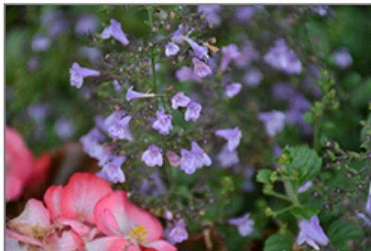
Marvelette Blue Dwarf Calamint flowers