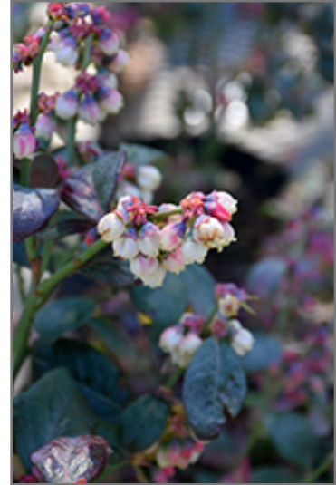
Pink Icing Blueberry flowers

This shrub is quite ornamental as well as edible, and is as much at home in a landscape or flower garden as it is in a designated edibles garden. It does best in full sun to partial shade. It does best in average to evenly moist conditions, but will not tolerate standing water. It is very fussy about its soil conditions and must have sandy, acidic soils to ensure success, and is subject to chlorosis (yellowing) of the foliage in alkaline soils. It is quite intolerant of urban pollution, therefore inner city or urban streetside plantings are best avoided, and will benefit from being planted in a relatively sheltered location. Consider applying a thick mulch around the root zone in winter to protect it in exposed locations or colder microclimates. This particular variety is an interspecific hybrid.