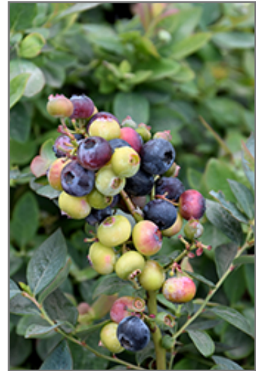
Pink Icing Blueberry fruit

Pink Icing Blueberry features dainty clusters of white bell-shaped flowers with shell pink overtones hanging below the branches in mid spring, which emerge from distinctive pink flower buds. It has bluish-green deciduous foliage which emerges pink in spring. The glossy oval leaves turn an outstanding aqua bluish-green in the fall. It features an abundance of magnificent blue berries in mid summer.