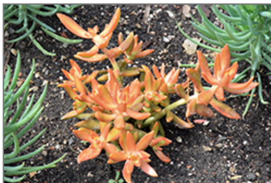
Coppertone Stonecrop