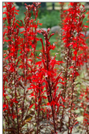
Black Truffle Cardinal Flower flowers

Black Truffle Cardinal Flower is recommended for the following landscape applications;