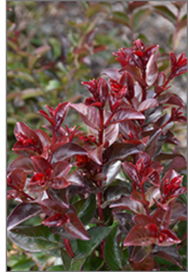
Cherry Mocha Crapemyrtle foliage

* This is a 'special order' plant - contact store for details