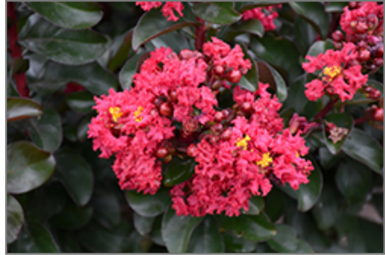
Cherry Mocha Crapemyrtle flowers

Cherry Mocha Crapemyrtle is recommended for the following landscape applications;