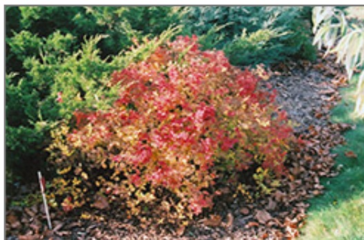
Golden Princess Spirea in fall