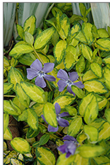
Illumination Periwinkle flowers

Illumination Periwinkle is recommended for the following landscape applications;