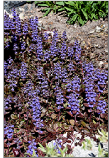
Mahogany Bugleweed flowers

Mahogany Bugleweed is a dense herbaceous evergreen perennial with a ground-hugging habit of growth. Its relatively fine texture sets it apart from other garden plants with less refined foliage.