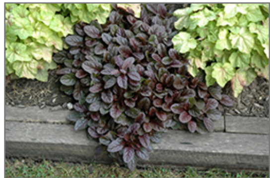
Mahogany Bugleweed