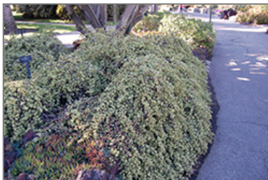
Variegated Elephant Food