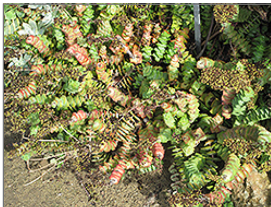
String Of Buttons

String Of Buttons is recommended for the following landscape applications;