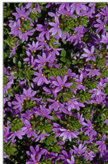
Brilliant Fan Flower flowers