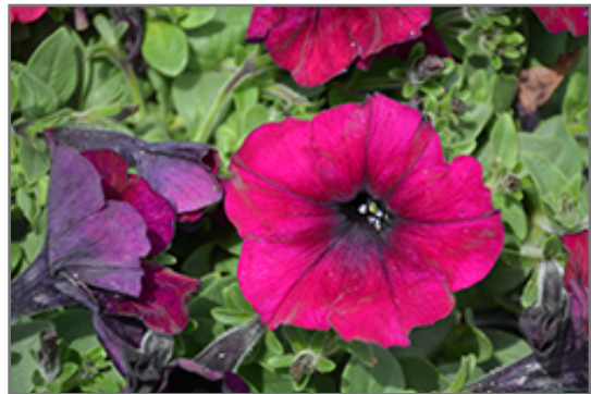
Easy Wave Burgundy Velour Petunia flowers