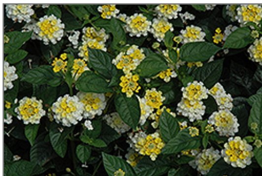
Lucky Lemon Glow Lantana flowers

Lucky Lemon Glow Lantana is recommended for the following landscape applications;