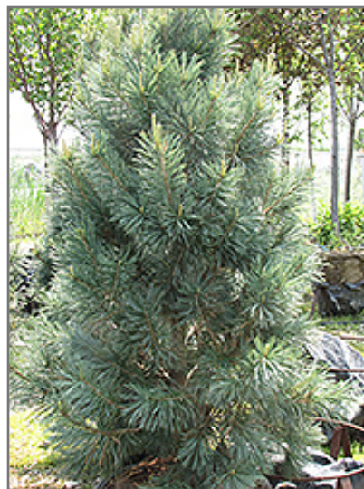
Vanderwolf's Pyramid Pine