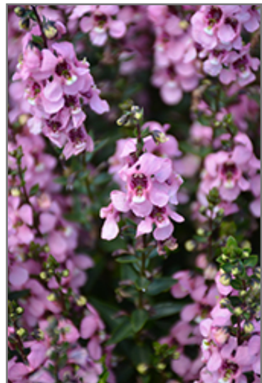
Serenita Pink Angelonia flowers