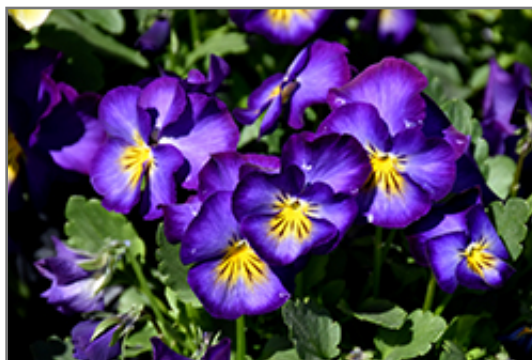
Halo Violet Pansy flowers