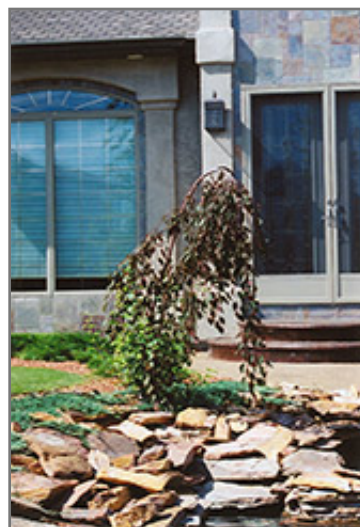
Royal Beauty Flowering Crab