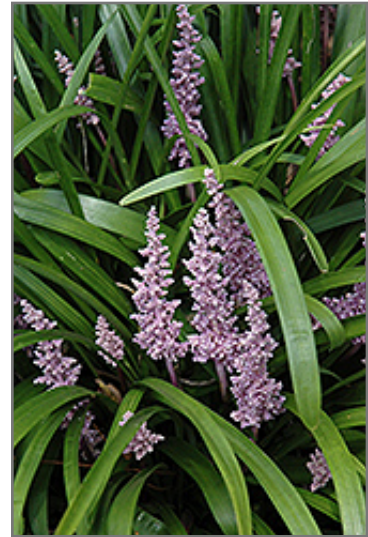
Lily Turf flowers