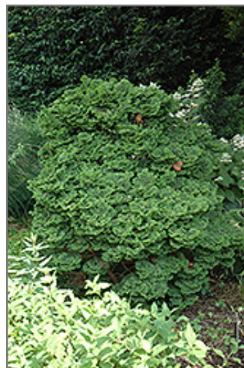
Koster's Falsecypress