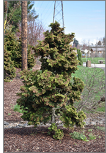
Koster's Falsecypress

* This is a 'special order' plant - contact store for details