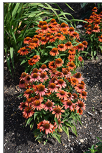
Sombrero Adobe Orange Coneflower in bloom