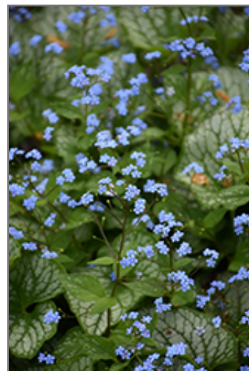
Sea Heart Bugloss flowers

Sea Heart Bugloss is recommended for the following landscape applications;