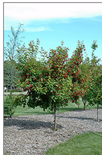
Ruby Slippers Amur Maple