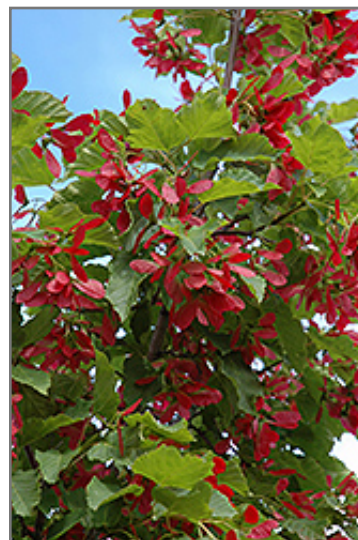
Ruby Slippers Amur Maple fruit