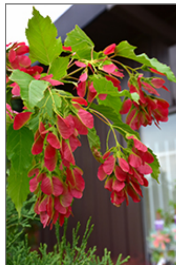
Ruby Slippers Amur Maple fruit