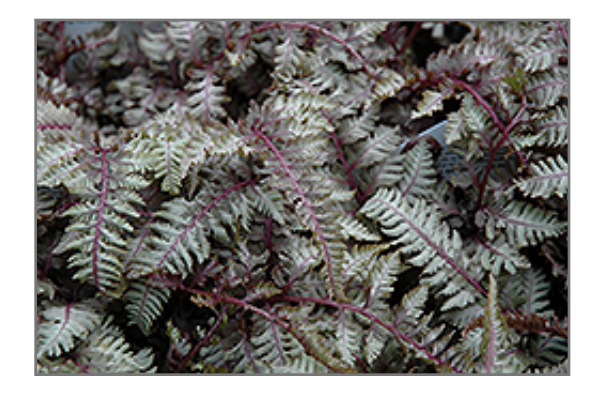
Regal Red Painted Fern foliage