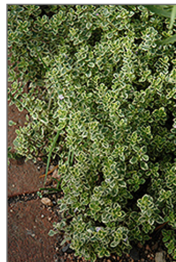
Aureus Lemon Thyme foliage