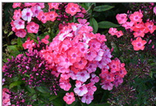
Garden Girls Glamour Girl Garden Phlox flowers

Garden Girls Glamour Girl Garden Phlox is recommended for the following landscape applications;