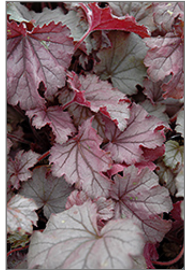
Little Cuties Sugar Berry Coral Bells foliage

Little Cuties Sugar Berry Coral Bells is recommended for the following landscape applications;