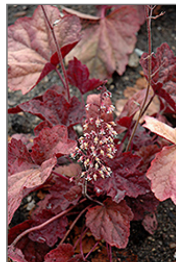
Lava Lamp Coral Bells flowers