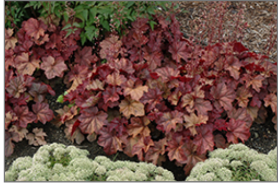
Lava Lamp Coral Bells

Lava Lamp Coral Bells will grow to be about 16 inches tall at maturity extending to 32 inches tall with the flowers, with a spread of 28 inches. When grown in masses or used as a bedding plant, individual plants should be spaced approximately 24 inches apart. Its foliage tends to remain dense right to the ground, not requiring facer plants in front. It grows at a medium rate, and under ideal conditions can be expected to live for approximately 10 years. As an evergreen perennial, this plant will typically keep its form and foliage year-round.