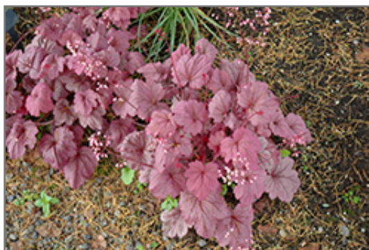
Georgia Plum Coral Bells