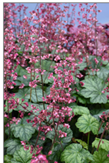
Berry Timeless Coral Bells flowers