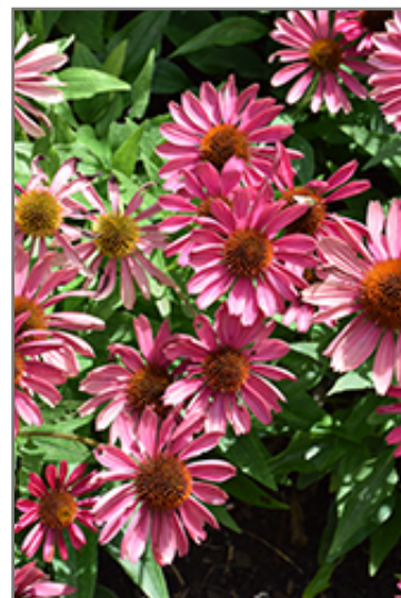
Butterfly Purple Emperor Coneflower flowers

This is a relatively low maintenance plant, and is best cleaned up in early spring before it resumes active growth for the season. It is a good choice for attracting birds and butterflies to your yard, but is not particularly attractive to deer who tend to leave it alone in favor of tastier treats. It has no significant negative characteristics.