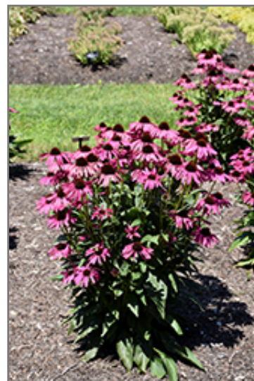
Butterfly Purple Emperor Coneflower in bloom

Butterfly Purple Emperor Coneflower is a fine choice for the garden, but it is also a good selection for planting in outdoor pots and containers. It is often used as a 'filler' in the 'spiller-thriller-filler' container combination, providing a mass of flowers against which the larger thriller plants stand out. Note that when growing plants in outdoor containers and baskets, they may require more frequent waterings than they would in the yard or garden. Be aware that in our climate, most plants cannot be expected to survive the winter if left in containers outdoors, and this plant is no exception. Contact our experts for more information on how to protect it over the winter months.